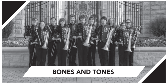
BONES AND TONES