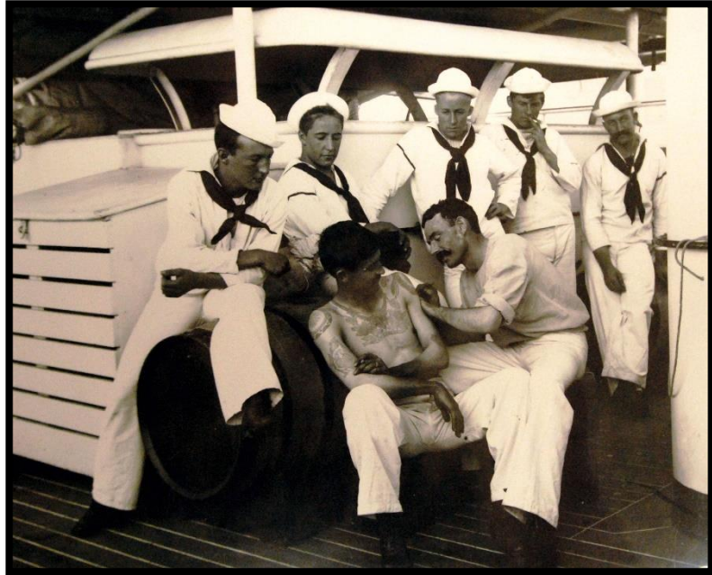
USS Olympia (Cruiser #6) tattooing, 1899. Men aboard the USS Olympia look on as the tattooing process is put in practice aboard their ship.

The turn-of-the-century also proved to be a turning point toward a more aggressive United States foreign policy. In 1898, the United States challenged Spain for dominance in the Caribbean and the Pacific Ocean. Victory over Spain resulted in United States control over Cuba, Guam, and the Philippines. Swift victories over Spanish fleets would give the United States a perspective that it had not experienced before, becoming a rising and formidable naval power on the global stage. 13 Soaring national pride among sailors led many to commemorate their victories and experiences with tattoos. On a ship stationed in Manilla Bay in 1899, men aboard the USS Olympia lined up for tattoos memorializing their wartime experiences, according to a fellow sailor. Surviving artwork of tattoo designs, descriptions of tattoos, and photographic evidence aboard the ship, suggests that the practice was not limited in its scope. 14 A 1898 Chicago Daily Tribune news article notes that expansion of body art inland included Camp Meade in Pennsylvania among other locations. The article