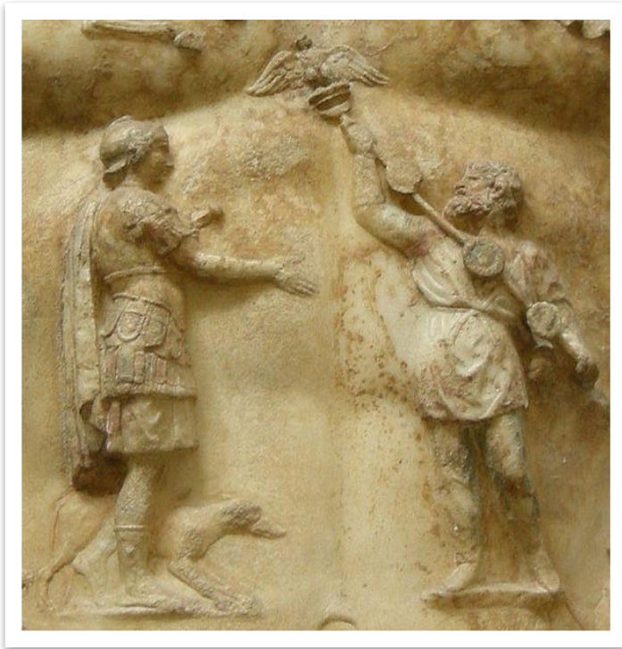
Chest piece of Augustus from the Prima Porta statue showing the return of Crassus' Aquila to Rome by the Persians. On display in Braccio Nuovo of the Vatican Museum, Rome.

Rome saw this influx of gold, silver, and spoils from the East as evidence of wealth and prosperity that could be exploited. The East was a source of gold and glory, craved by Crassus and other Roman leaders. This sense of the Parthians as a weak and deceitful enemy, who were wealthy and soft was critical to understanding how a seasoned general like Crassus would seek out war in Persia. To secure himself and to navigate the pressures of Rome, he made a choice that proved to be fatal.