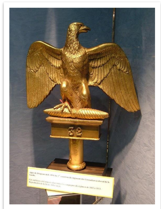
French Imperial Eagle, made in the style of Roman Aquila , on display at the Louvre des Antiquaries in Paris.