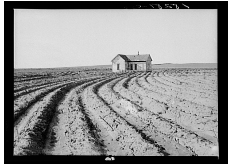
Fig. 1.2 204

Just like the problems created by the AAA, many landowners in Texas, Oklahoma, Arkansas, and Kansas, were forced to dismiss the tenant farmers and sharecroppers who worked upon their land. Conditions within the South were deplorable. West Texas land was unproductive because of the dust storms, lack of rain, and the economic depression. In Power Farming Displaces Tenants... , Childress County, Texas, June 1938 (Fig. 1.2), Lange's caption reads, "Tractors replace not only the mules, but people. They cultivate to the very door of the houses of those whom they replace." The farmers had nothing in their fields. The barren land had been cultivated in every cardinal direction with the hope of fruitful production. The tractors, many funded by government provisions, made the work of tenants and