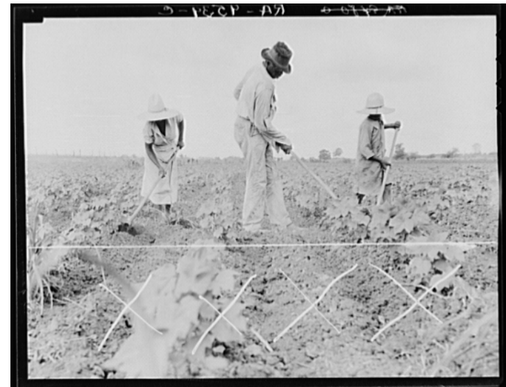
Fig. 1.3 210

enough to bring most of them out of a depressed and generally degraded condition in both the Delta and the Black Belt." 209 Even though the goals of the RA/FSA were to assist Americans in their fight against the Depression, the agencies discriminated against the black population because they did not meet the "standards" of assistance.