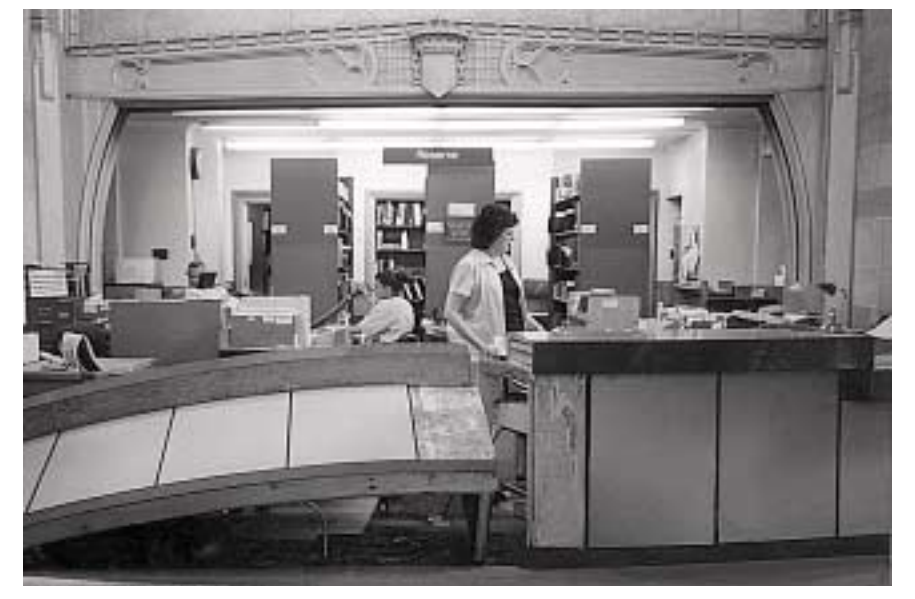
The first service desk to be disassembled was the Reserve desk at the north entrance of the library.