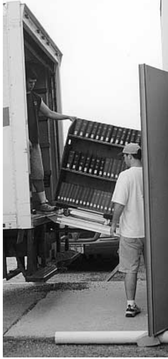
Unloading carts of older periodicals from the moving van at Booth West.