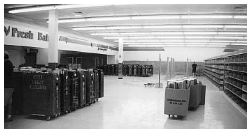
Shelving was also installed in space previously occupied by a grocery store. Located a half mile from campus, Booth West houses materials in LC classes P-V, older bound journals, government documents, and maps.