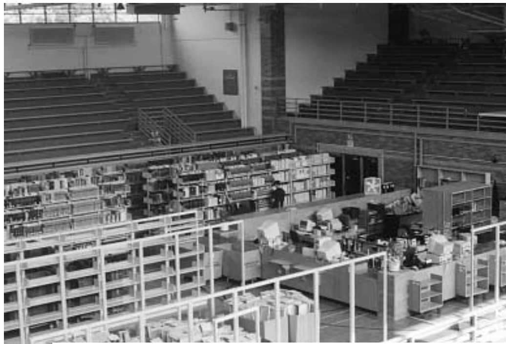
The Reference and Circulation public service desks along with shelving for the Reference collections were relocated to the McAfee south gym.