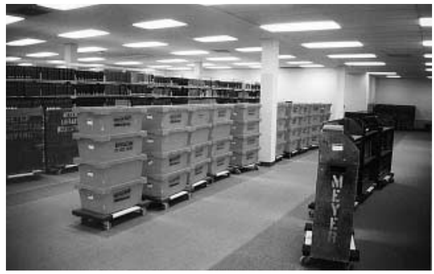
The relocation of collections began on May 13th and continued over a six-week period. Materials were loaded onto carts and into crates, while concurrently, shelving was disassembled throughout Booth Library and reassembled at each of the various temporary sites.