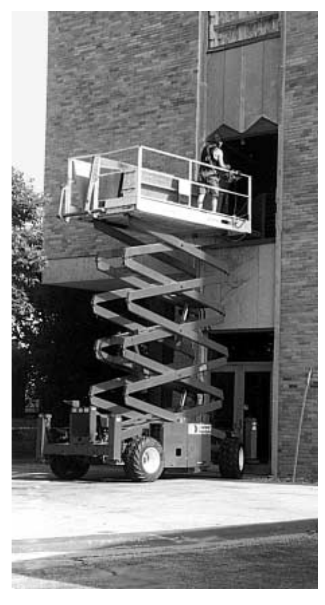
Windows from the south façade were removed to facilitate the transport of materials located on the upper levels of the library.