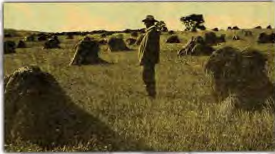
Postcard image courtesy of Booth Library Special Collections