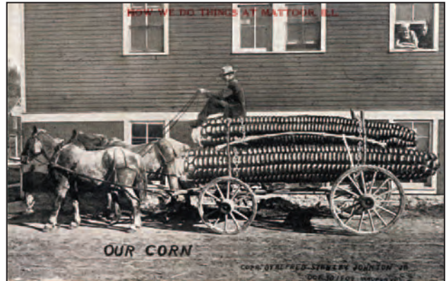
Postcard courtesy of Booth Library Special Collections

The photo shown above was taken about 1900 in Eastern's campus gardens, which were planted and maintained as a learning project by the children of the "model school" with help from their teachers and members of the grounds crew.