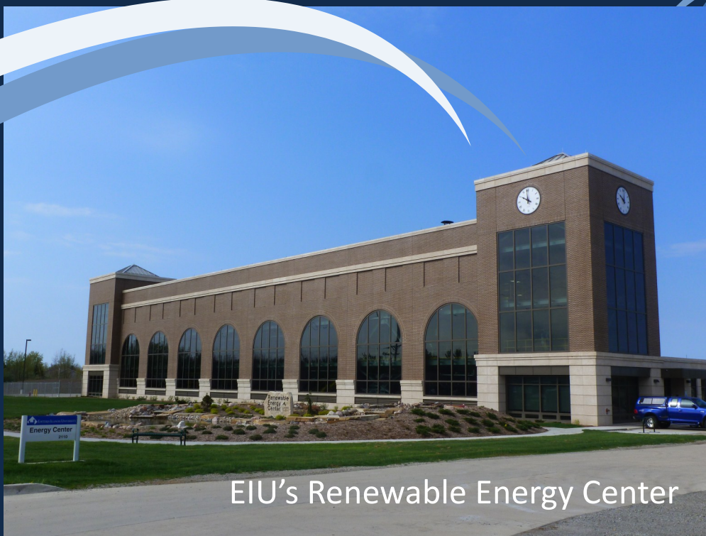
EIU's Renewable Energy Center

Department of Biological Sciences Eastern Illinois University